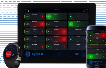
Agent-IC on various mobile devices