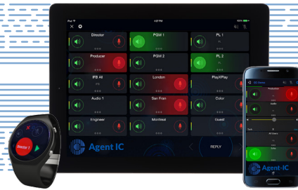
Agent-IC on various mobile devices