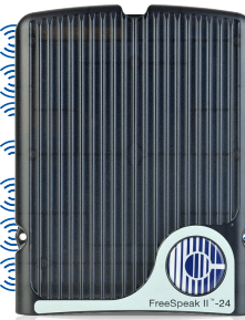
FreeSpeak II 2.4 GHz Transceiver Antenna