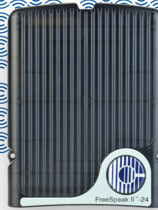
FreeSpeak II 2.4 GHz Transceiver Antenna