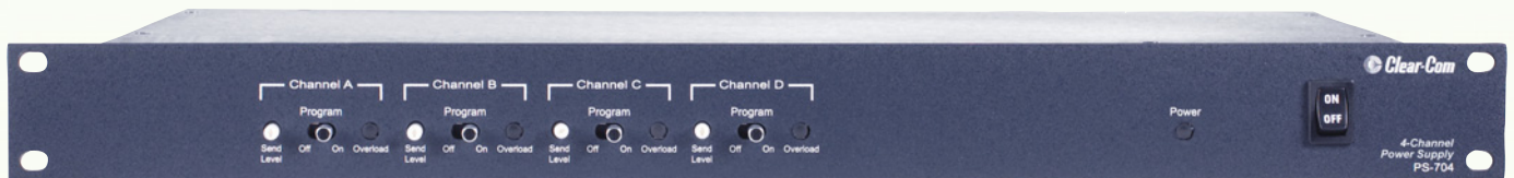
PS-704 Front Panel

The PS-704 is a four-channel, single-rack-space intercom power supply that features Clear-Com's "fail-safe" design for maximum reliability. The power supply delivers 2 amps at 30 volts, supplying power for one to four channels of intercom. It will support up to 40 beltpacks, 10 speaker stations or 12 headset stations.