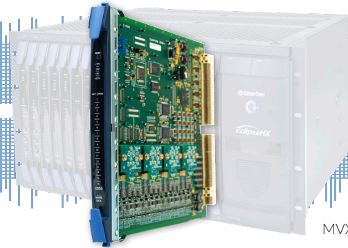
MVX-A16-HX Interface Card