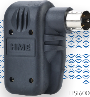
HSI6000 Headset Interface Adaptor