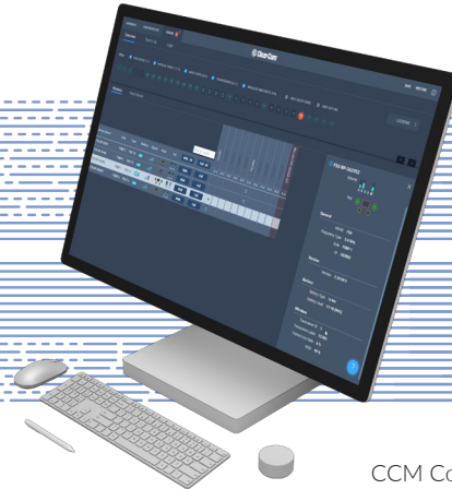
CCM Configuration Software