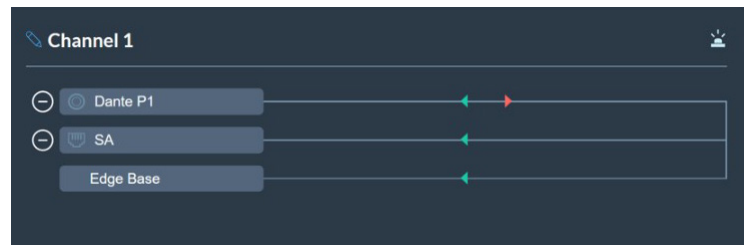
Stage Announce inside a Channel